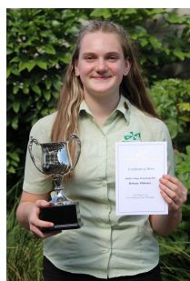
Chris Betty Cup Top All Round Year 9&10 student across the four kete