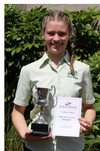
The Tim Foy Cup For a Year 10 student for industry, co-operation and service