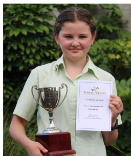
Betty Family Cup Top Year 7&8 Academic student

Due to COVID-19 Alert Levels, this year we had a virtual Junior College Prizegiving on Monday 6 December. The prizegiving presentation was posted on the Tuakau College Facebook page, Instagram page and website ( http://www.tuakaucollege.com/academic-prizegivings ).