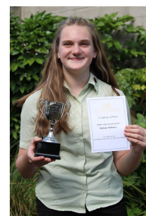
The Wooton Cup Top Year 9&10 Physical Education student