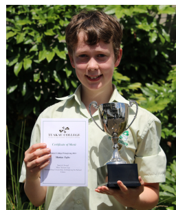
Mary Nelson Cup For outstanding citizenship and embodying the school values