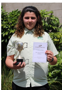
The Principal's Cup Top Year 9&10 student for overall Academic Excellence

Due to COVID-19 Alert Levels, this year we had a virtual Middle College Prizegiving on Wednesday 8 December. The prizegiving presentation was posted on the Tuakau College Facebook page, Instagram page and website ( http://www.tuakaucollege.com/academic-prizegivings ).