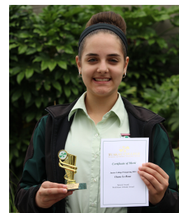
Wolfsbauer Attitude Award For Excellence in Attitude