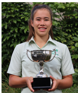
Paton Family Cup Top All Round Year 7&8 Student