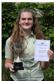
The Hema Cup For reflecting the school motto across the four school values