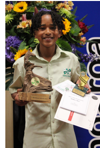
Wolfsbauer Attitude Award For Excellence in Attitude