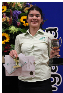
Chris Betty Cup Top All Round Year 9&10 student across the four kete