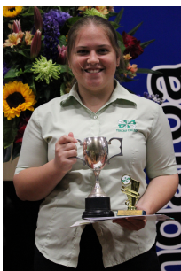
The Principal's Cup Top Year 9&10 student for overall Academic Excellence