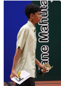
Rowan Hucker Cup For the top Year 7&8 student in PE