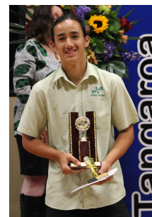
The Douglas Hughes Memorial Trophy For Whaanau loyalty