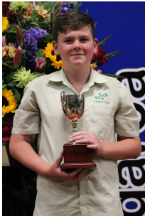
Betty Family Cup Top Year 7&8 Academic student