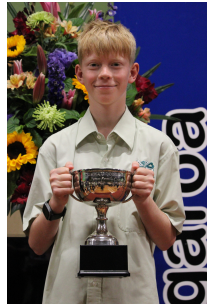
Paton Family Cup Top All Round Year 7&8 Student