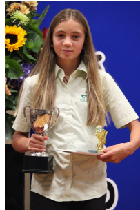
Mary Nelson Cup For outstanding citizenship and embodying the school values