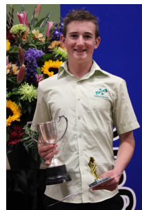
The Hema Cup For reflecting the school motto across the four school values