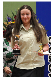
The Tim Foy Cup For a Year 10 student for industry, co- operation and service