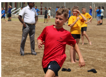
House Points Update