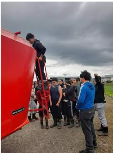
Te Whakaranu - into the mixer it all goes!