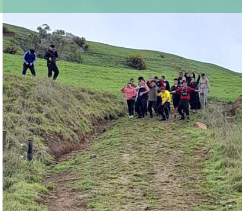
Te Whakatoo tupu - Getting a good view of the reparation planting from up on the hill