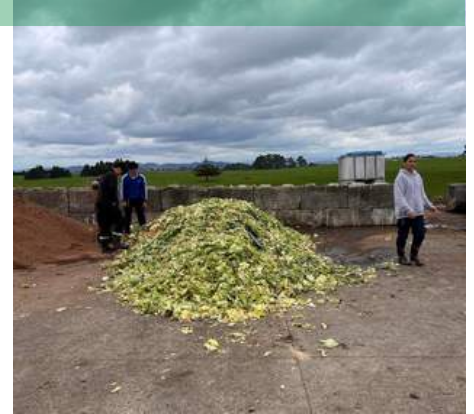
Ngaa para kai - Inspecting disregarded food waste that will feed the cows