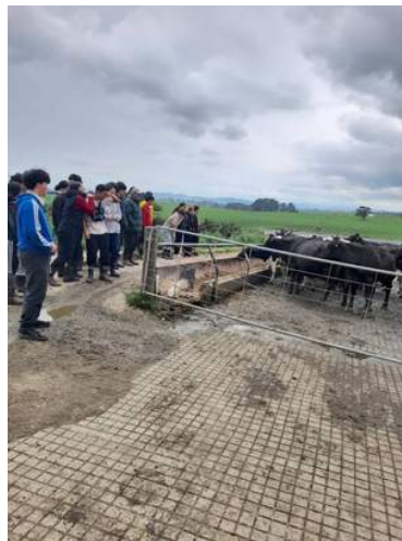
Te Waa Kai - out on to the feeding pad before afternoon milking time.