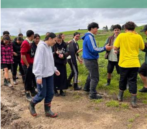
Students studying the Waea hiko (electric fence)