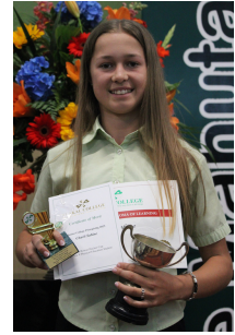
Rowan Hucker Cup For the top Year 7&8 student in PE