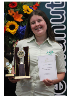
The Douglas Hughes Memorial Trophy For Whaanau loyalty