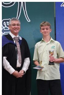
Chris Betty Cup Top All Round Year 9&10 student across the four kete