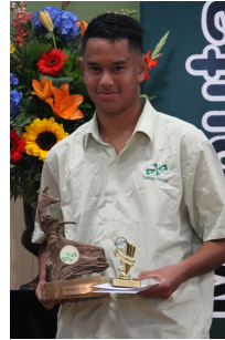
Wolfsbauer Attitude Award For Excellence in Attitude