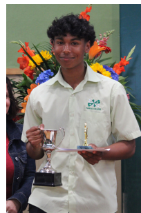
The Tim Foy Cup For a Year 10 student for industry, co- operation and service