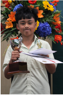
Betty Family Cup Top Year 7&8 Academic student