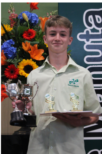
The Principal's Cup Top Year 9&10 student for overall Academic Excellence