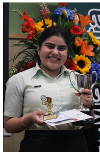
The Hema Cup For reflecting the school motto across the four school values