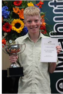
Paton Family Cup Top All Round Year 7&8 Student