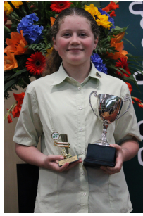
Mary Nelson Cup For outstanding citizenship and embodying the school values