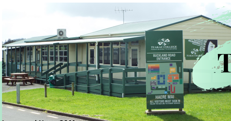
Inaugural Year: 2021