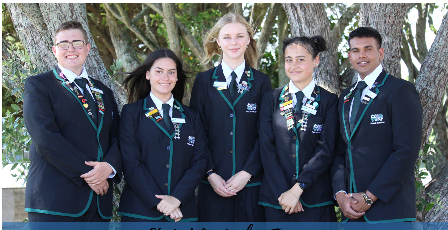
Student Leadership Team 2021